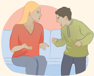
Increased restlessness, agitation or aggression