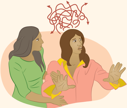
Getting more and more confused

If a person has had a blow to their head, face, neck, or body, they might have a concussion. Watch for these red flag symptoms. If they show any of these symptoms call 911 and get immediate medical help.