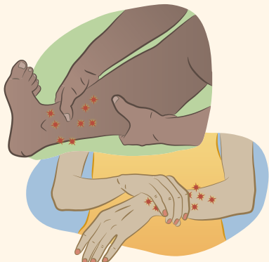
Tingling or weakness in arms or legs