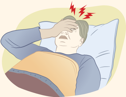
Severe headache that keeps getting worse